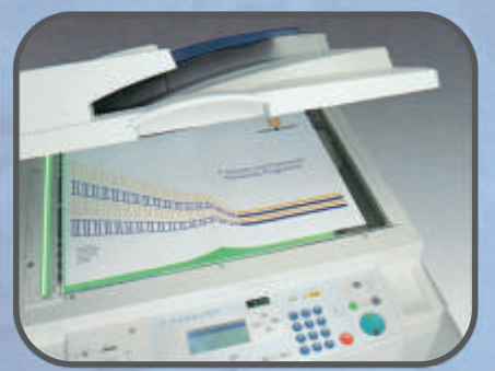
Scan A3 documents and conveniently reprint to A4 size