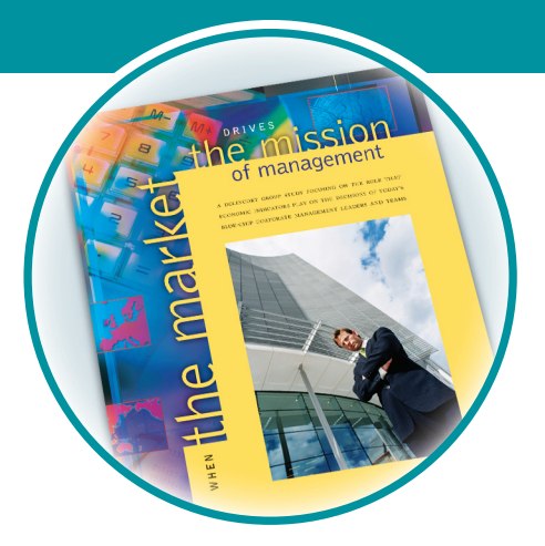
Expect vivid, intense colors with a powerful 1200 dpi print engine and new PxP oil-free toner.