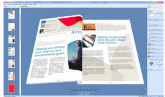
Xerox® Integrated Fiery® Color Server