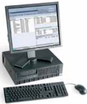
Xerox® FreeFlow® Print Server

Each server is designed to meet a specific set of workflow and application requirements. Your Xerox representative will help you choose the one that best suits your needs.