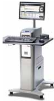
Xerox® EX Print Server, Powered by Fiery®*