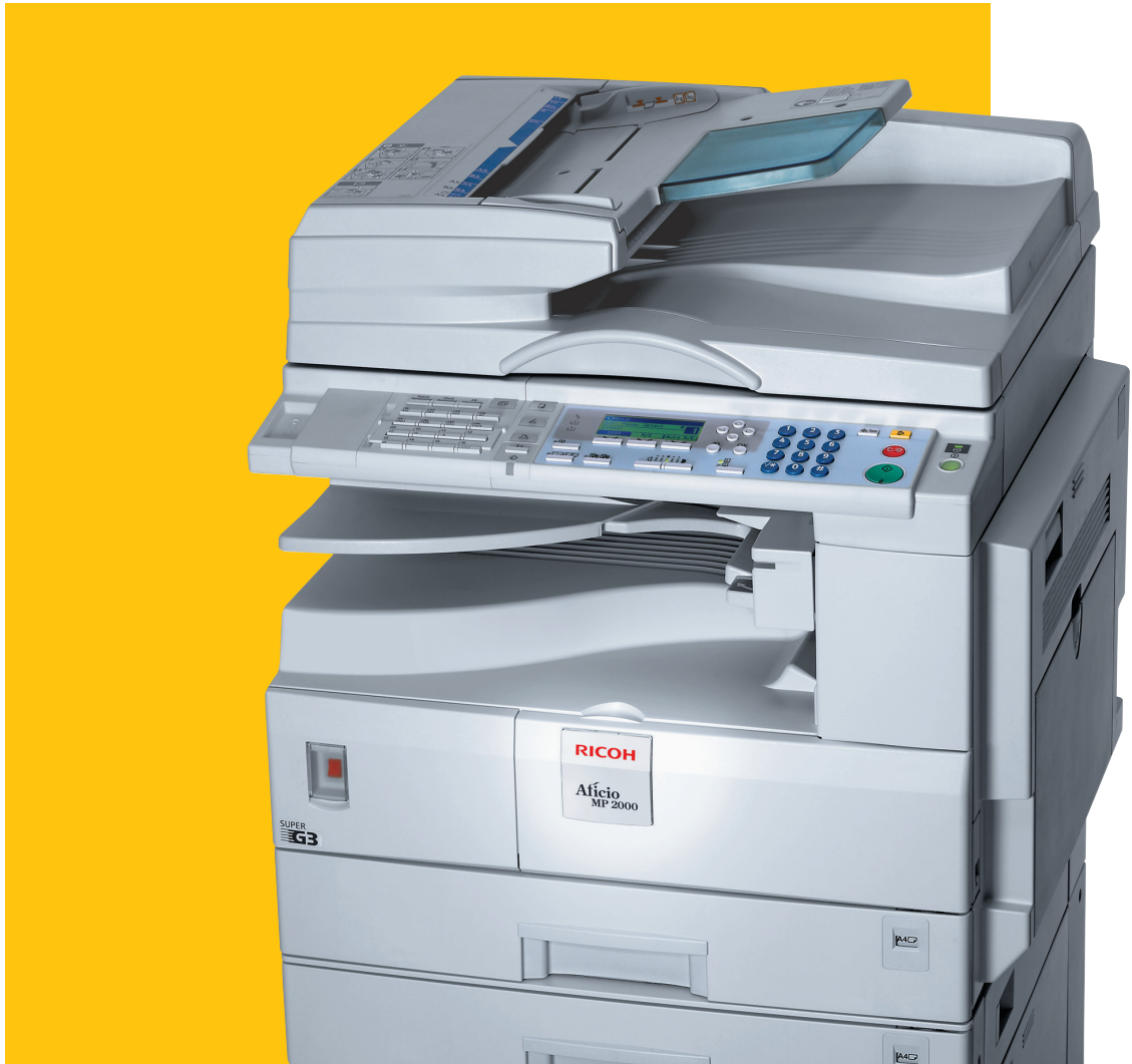
Aficio™ MP 1600/MP 2000