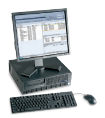
Xerox® FreeFlow® Print Server

Each server is designed to meet a specific set of workflow and application requirements. Your Xerox representative will help you choose the one that best suits your needs.